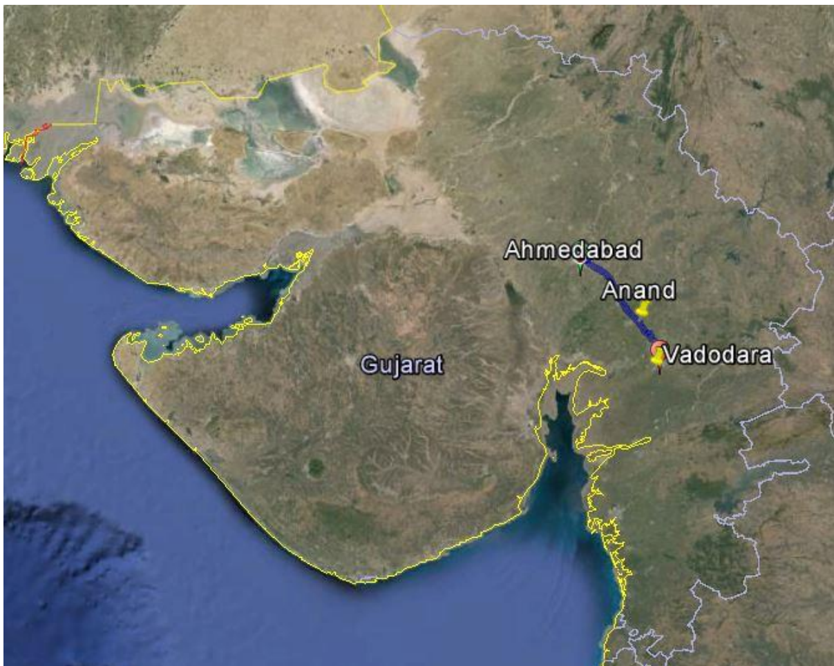
Figure 1: Anand Location

Parents were given the survey forms which had two parts: their own details and their children details. A total of 526 samples were collected from 30 schools in the region (summarised in Table 1). The scope of the sampling was limited to primary schools, having students aged below 15 years. This forms the target group because of their higher dependency on parents for travelling to school. The sampling method adopted in this study is proportionate stratified sampling. The schools are divided in two strata (government and private) and sampled based on the proportion of school in each strata.