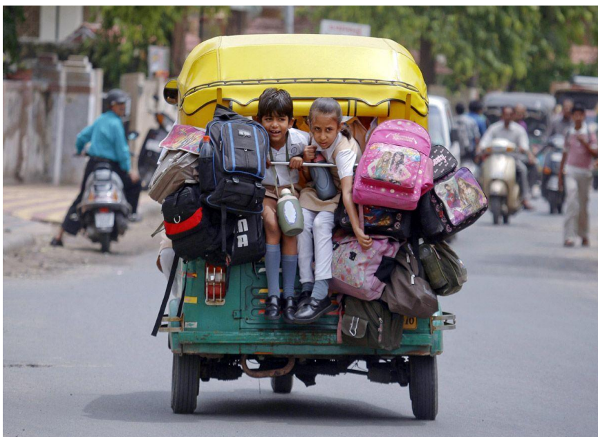
Figure 2: School children in Ahmedabad July 20, 2011

Vehicular ownership has a significant impact on mode choice of school going children. If parents do not own a vehicle then log odds of choosing NMT are very high. Also, a particular behaviour is observed here that if a family does not own vehicle then odds of choosing NMT are high over public transport. The reason could be that families who do not own a vehicle are unable to afford public transport (which includes van, auto rickshaw, city bus, and school bus). Second reason might be that public transport does not seem to be a safer option due to deterrents like overcrowding or accidents, etc.